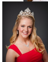
Princess Francesca Nevil