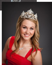
Princess Anissa Sangster