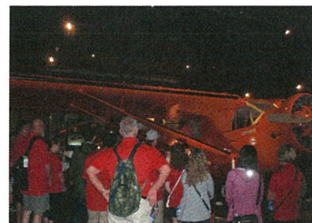
Delegates at the Misawa Aviation and Science Museum

in our schools about local history. Maybe schools could have a "Misawa Minute" announcement once in a while? How about a 15