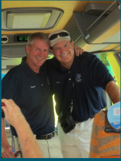
Two for the road.

"The welcome we received in Misawa was wonderful. We were all treated like royalty!"